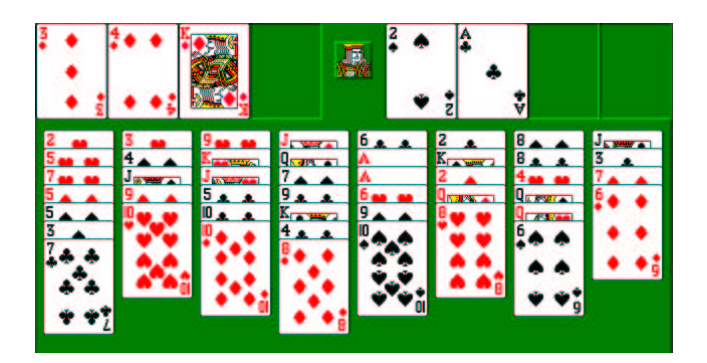
Figure 1: A FreeCell game configuration. Cascades: Bottom 8 piles. Foundations: 4 upper-right piles. FreeCells: 4 upper-left piles. Note that cascades are not arranged according to suits, but foundations are. Legal moves for current configuration: 1) moving 7. from the leftmost cascade to either the pile fourth from the left (on top of the 8\Diamond ), or to the pile third from the right (on top of the 8\heartsuit ); 2) moving the 6\diamondsuit from the right cascade to the left one (on top of the 7.); and 3) moving any single card on top of a cascade onto the empty FreeCell.

Copyright 2011 ACM 978-1-4503-0557-0/11/07 ...$10.00.